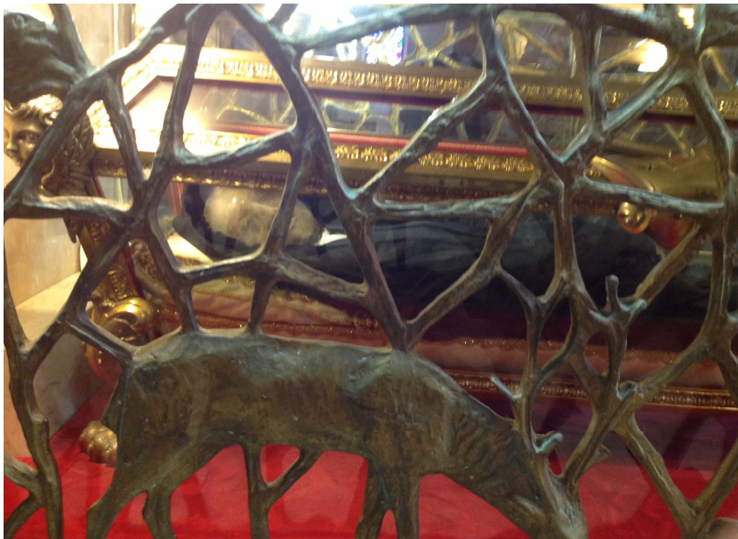
Crypt of St. Lucy