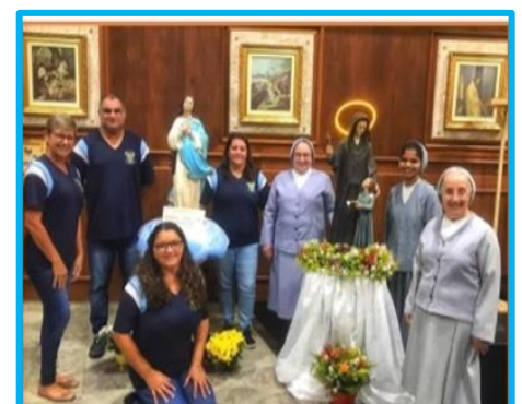
Community in Peruíbe, San Paolo